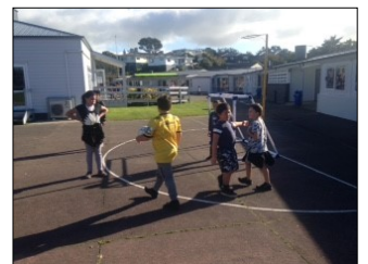
Refereeing lunchtime games