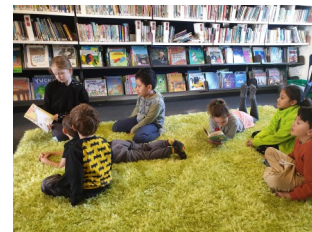
Student Leaders' Library Club